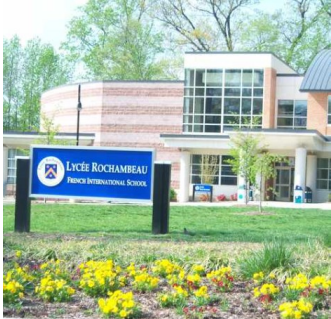
LYCÉE ROCHAMBEAU The French International School